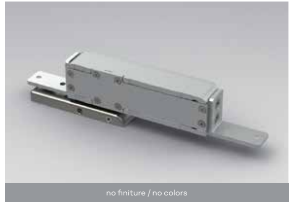
no finiture / no colors

• Hydraulic hinge for framed doors with predetermined, non-modifiable automatic closing. Stop at 0° +90° -90°. Suitable for doors with a stop as well. Combining the lower hinge with the upper one allows the reduction of closing speed of some seconds.